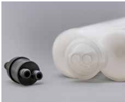
The various changeable adapters allow the use of different cartridges