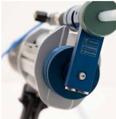
The cartridge mixer is attached to an existing gun