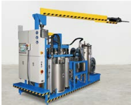
Design example of a volume flow controlled TARDOSIL with automatic refilling for A and B