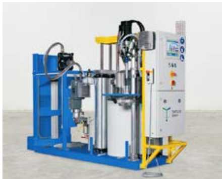
Design example of a TARDOSIL with 200 l tank (A) and 30 l pressure tank (B) with automatic refill